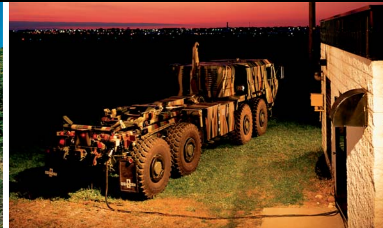
ProPulse equipped HEMTT-LHS easily powers an airfield.

The simplified drive train of ProPulse delivers more power. The diesel engine drives a 335 KW generator that delivers power to electric motors dedicated to each differential. This direct transfer of power eliminates the need for the torque converter, transmission, transfer case, and drive shafts, making the entire system more efficient with fewer moving parts.