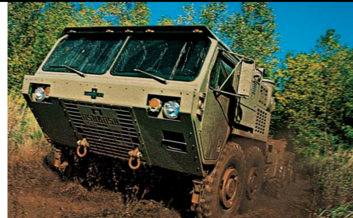
The ProPulse system provides the power to traverse the most demanding terrain.